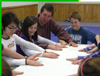
Teaching a new game to 5th and 6th graders!

senior homeschoolers and one junior homeschooler joined us at Penobscot. We have been so blessed by their energy and enthusiasm! If you are interested in joining us for a week, please contact me for more information!