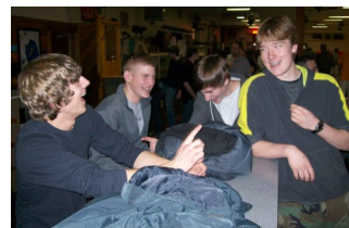
PCS alumni and Deerwander campers laugh together at the bowling reunion during our week at PCS

an option for any of us. It’s a necessity, and this book is filled with excellent insights and tips. As the authors write on the back cover, “The emerging generation needs positive life-on-life influence from adults now more than ever if they are to truly thrive.” Whether you are in youth ministry or not, you have an important role to play, and this book will help equip you for the journey!