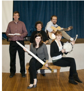
Our full-time team

be a new school for us and we'll be working with grades K-8. The