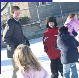
In-between exhausting games of Tag!

Coastlands is a relationally-based ministry providing on-site mentoring teams in a variety of Christian venues, including Spiritual Emphasis Weeks, class trips, retreats, men’s and women’s minis-