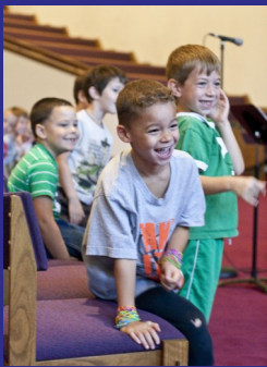
Psalm 122:1: “I rejoiced with those who said to me, ‘Let us go to the house of the Lord.’”

just loving on kids and showing them that they are sons and daughters of the living God. I can tell that God has surely blessed this ministry and hope that God keeps making this ministry everything He has called it to be. I would love to join this ministry in the future because God is with them everywhere they go, and I experienced that the week I was with you guys. The way you teach the kids is so simple and fun, it keeps the kids attention. I loved my week with you guys and hope to go again soon.”