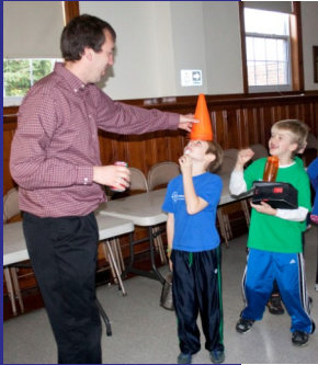
One of many uses for orange cones!