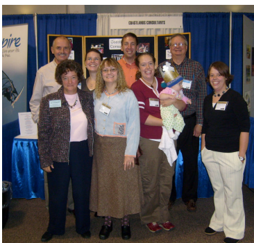
Coastlands team members, board members, and supporters in front of Coastlands' display at the ACSI Teacher Convention

As we enter '08, Coastlands faces unprecedented open