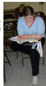
A student looks up a verse in the Bible while working on her journal